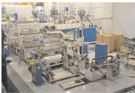
Project @ Tetra Pak