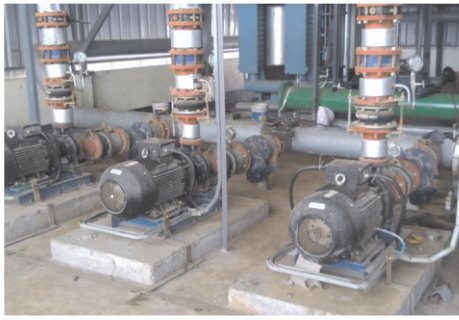
Project @ Abul Khair Steel-II