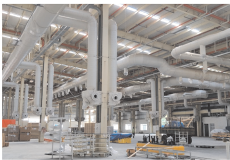
Project @ John-Deere