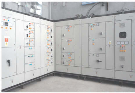
Project @ Anantara Resort, Maldives-II