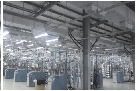
Project @ JM Fabrics, Bangladesh-I