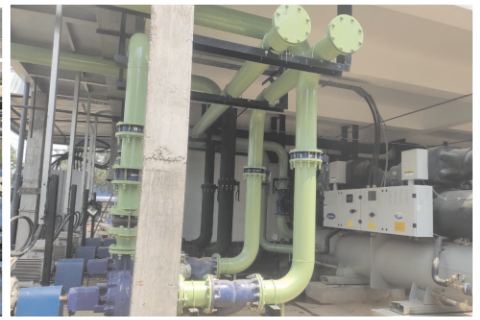
Project @ Lalan Rubber-II