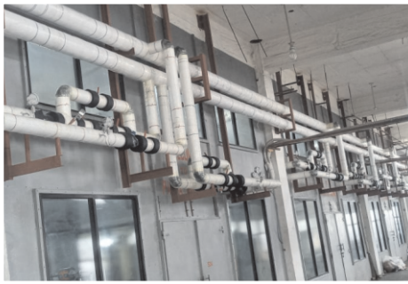
Project @ Bombay Sweets-II