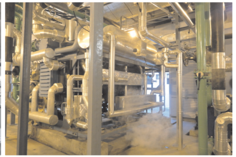
Project @ Anantara Resort, Maldives-I