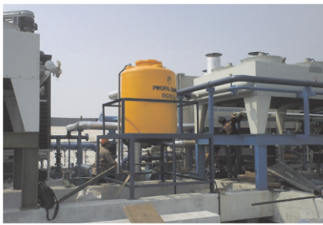
Project @ Dynaplast, Indonesia-I