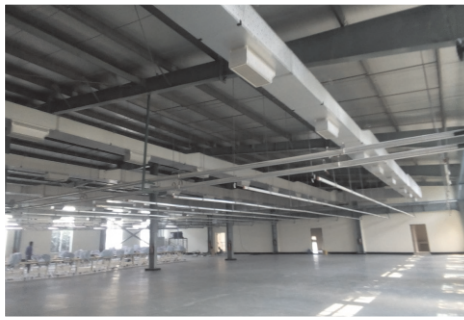
Project @ JM Fabrics, Bangladesh-II