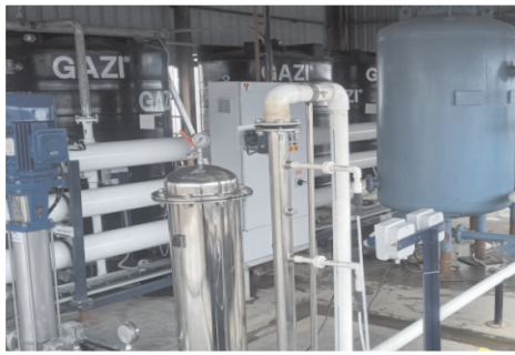
Project @ Bombay Sweets-I