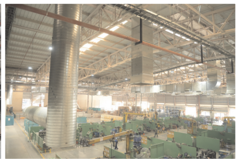
Project @ JCB