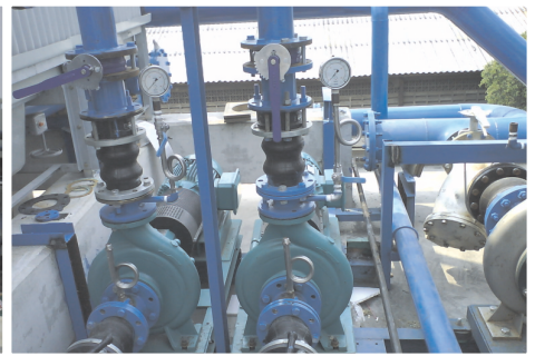
Project @ Dynaplast, Indonesia-II