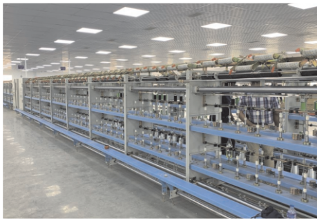
Project @ Lalan Rubber-I